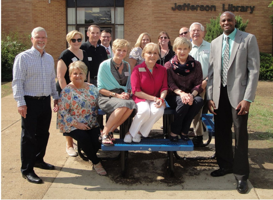
The Foundation Board and Administrators from 2017 during the Grant Patrol where teachers are awarded grants.